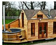
"Shark Tank" Star's Mortgage Payoff Tip Has Banks On Edge Bills.com