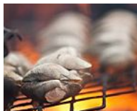
It's not Summer in CT Without a Pit Stop at These Top Spots CT Tourism