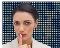
PST Archiving - Your Employees' Dirty Little Secret CommVault