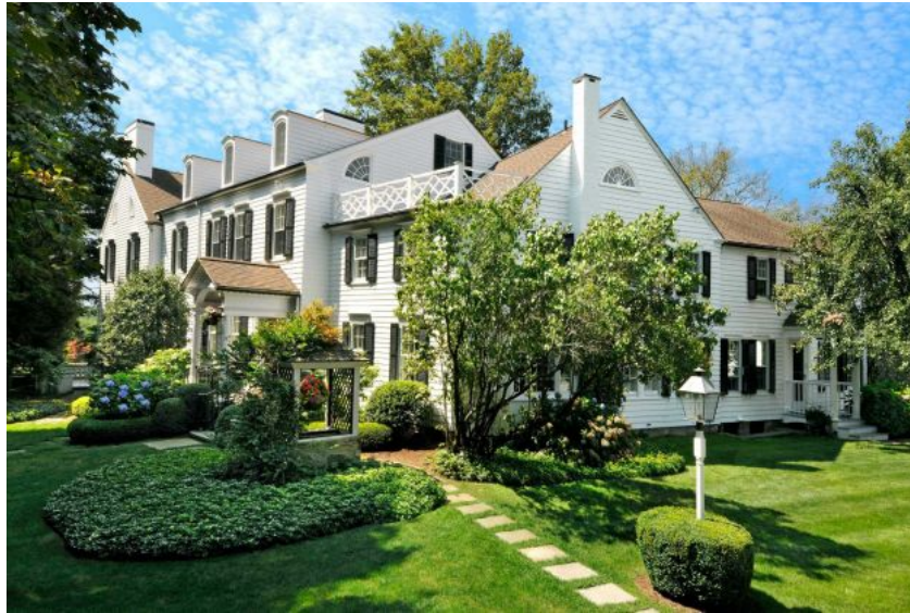
A Taconic Road estate in Greenwich, Conn. was among nearly 300 homes sold in the town there in the first half of 2015, with listing agent Sotheby's International Realty noting an increase in market volume throughout the region between April and June. Photo: Hearst Connecticut Media Buy this photo