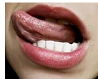
Eosinophilic Esophagitis? Yep, And This Is Why You Need To Be Aware Health Central