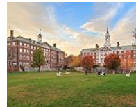
The 25 Toughest U.S. Colleges to Get into TheStreet