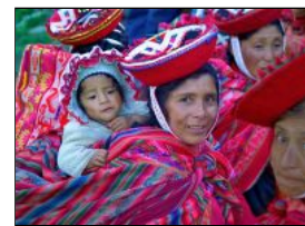
Travel photography subject of free Westport Library program