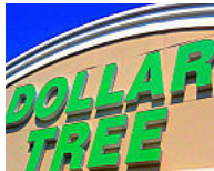
The 8 Absolute Best Things To Buy At The Dollar Store The Daily 8