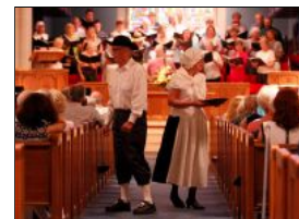
Greenwich Celebrates 350th Founder’s Day