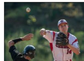
Greenwich Cannons edge Oakville, advance to second round of American Legion tournament