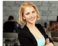
This App is Quickly Replacing Human Financial Advisors Business Insider