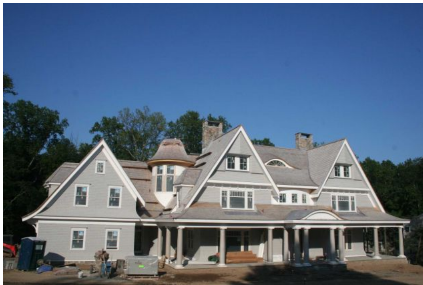
The exterior of 114 Skyview Lane