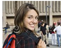
Forbes Ranks the 100 Best Colleges in America Forbes