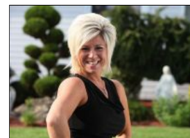
Reality TV star does interactive Uncasville show