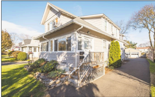
William Pitt Sotheby's International Realty

This 92-year-old two-family unit is located on a quiet tree-lined street in the desirable Springdale section. The first-floor unit has an enclosed heated front porch, two bedrooms, a living room and dining room with built-ins and one full bath. The kitchen is well equipped and includes a walk-in pantry and rear yard access. The main floor also had hardwood floors in most rooms and comes complete with French