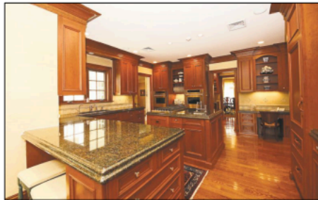
The spacious gourmet kitchen features a center island and counters topped in Uba Tuba granite, an open dish rack, cherry cabinetry, built-in desk area, French doors to the patio, and high-end appliances.

For information or to set up an appointment to see the house contact Marlene Marrucco Recchia of William Pitt Sotheby's International Realty at 203-257-1080 or mrecchia@williamspitt.com .