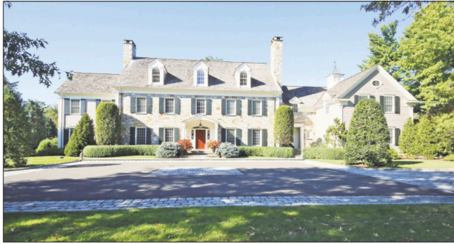
The custom-built 12-room colonial at 1481 Hillside Road sits on a nearly three-acre property with an in-ground swimming pool and tennis court.

C1 | Fairfield Citizen | Friday, June 8, 2018