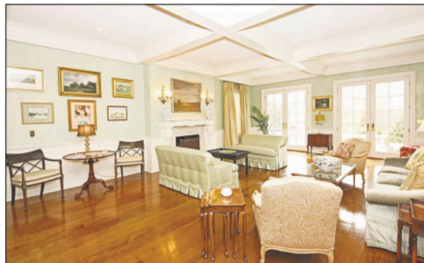
The formal living room features a marble gas-log fireplace with an ornately carved mantel, coffered ceiling and two sets of French doors to the backyard.

driveway passes a large carpet of green lawn to the spacious firecourt in front of the gray-colored stone and wood house with black shutters and off-white trim. It provides ample parking for guests. A wide bluestone path leads to the covered formal front entrance. Along the roofline there is