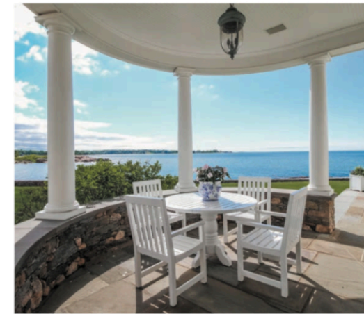
OPPOSITE: 233 Overlook Drive, Greenwich, Conn.